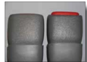
A comparison of the Gen 2 and Gen 3 seat belt buttons. The Gen 3 had a button that protruded from the cover.

One example was the Gen 3 seat belt installed in more than 14 million DaimlerChrysler cars and minivans, including the one Bart Moran was driving. The Gen 3 had a button that protruded over the button cover, allowing it to be accidentally depressed by a flailing arm or loose object. At least 15 deaths and 18 serious injuries were caused by its malfunction. Even after Chrysler's engineers identified the problem and recommended a newer, safer seat belt, the car manufacturer continued to use the Gen 3 in many models, often in the back seat.